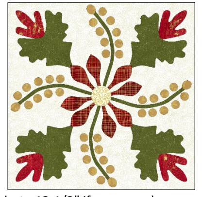
Figure 12 – Make 4 (Trim blocks to 12-1/2" if necessary).