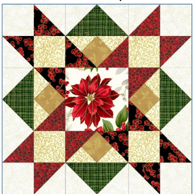
Figure 11 - Make 5.

11. Noting fabric orientation, sew a step 8 strip to the top and one to the bottom of the step 10 units to complete five 12-1/2" blocks ( figure 11 ). Press the seams open.